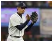
ノーヒットノーランを達成したマリナーズの岩隈

マリナーズの岩隈は12日、シアトルで行われたオリオールズ戦に先発しノーヒットノーランを達成。今季11試合目の登板で4勝目(2敗)をマークした。