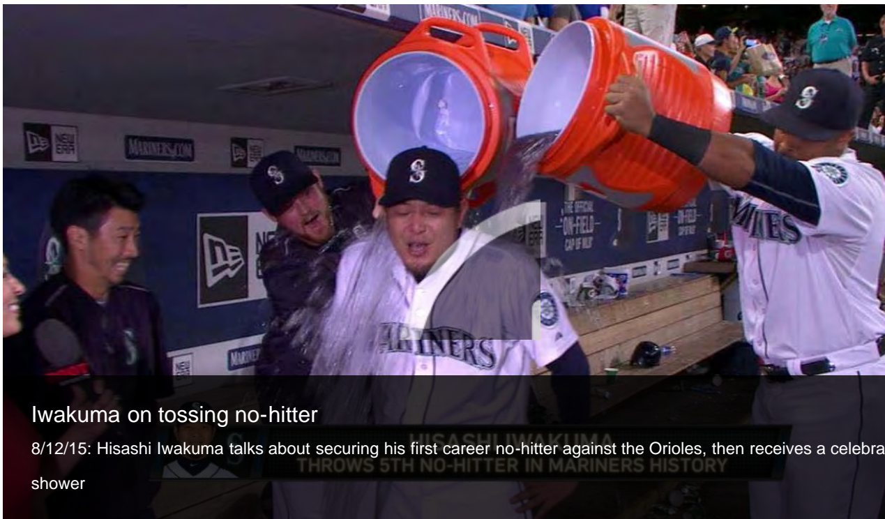
Iwakuma on tossing no-hitter