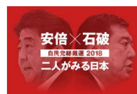
安倍×石破 二人がみる日本 自民党総裁選