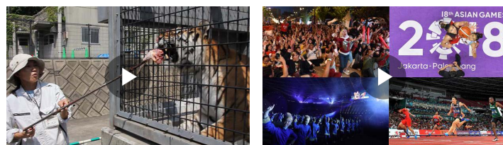
ライオンもトラも熊本に帰るよ 震災で避難、2年半ぶり えっ、こんな新競技も スライドショーで見るアジア大会