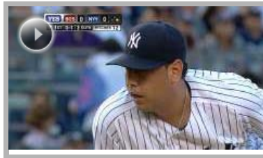
BOS@NYN: Nuno shuts out Sox over 5 2/3 stellar frames

Nuno walked two and struck out five, authoring another chapter of frustration for the Red Sox, who entered play on Friday ranked third to last in the American League in runs scored.